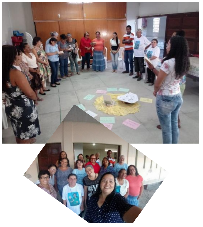
Meeting of laities of the Assumption

We are inserted in a new missionary place, the housing project "Moura Brasil", where poverty tends to cut families from their community. Many are affected by drugs – wh ether legal or not -unemployment, and many children grow up in the midst of suffering and misery.