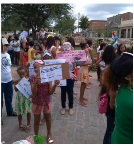
Demonstration against the breaking up of the Unique Social Aid System (SUAS)