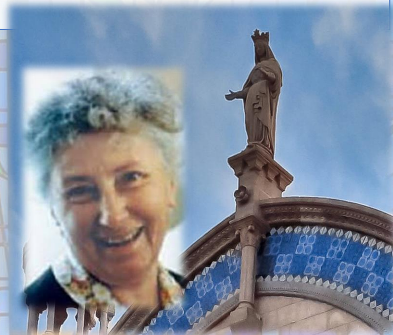
Notre Dame d'Afrique (Our Lady of Africa) is a Catholic basilica in Algiers , Algeria .